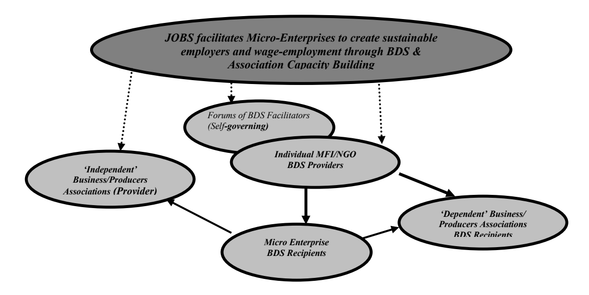
Figure 1: JOBS' BDS Mechanism as a Means of Poverty Reduction